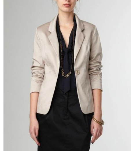
T A I L O R E D J A C K E T