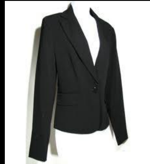
B L A Z E R