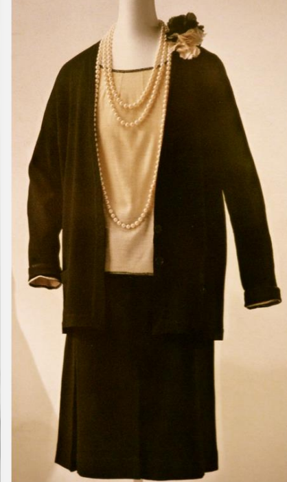
Conjunto calle Chanel 1928